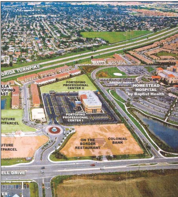
Villa Portofino East Commercial (Homestead)