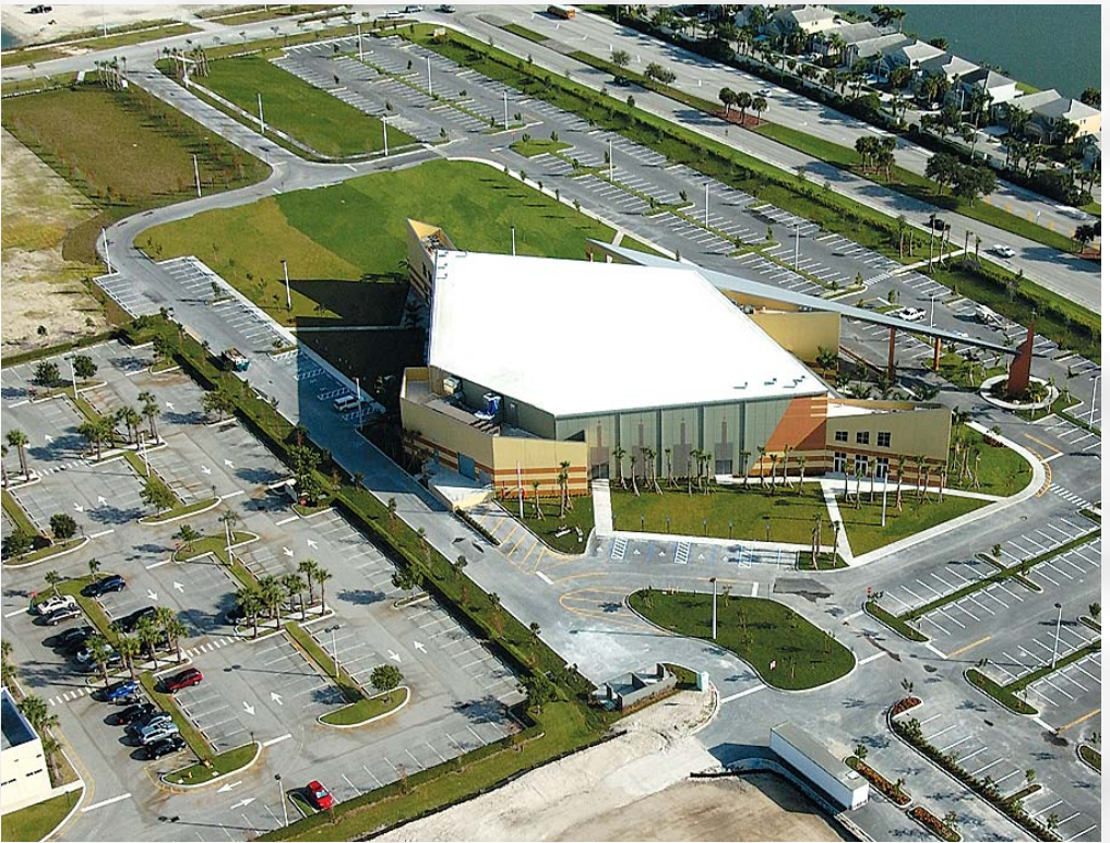
Community Christian Church (Tamarac)